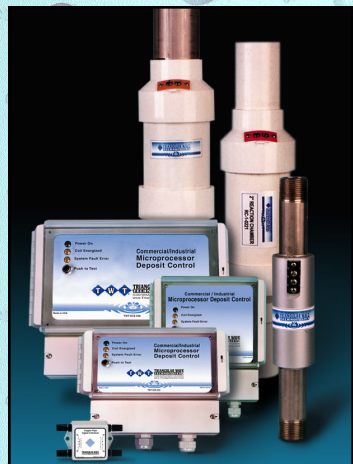
Triangularwave Deposit Control Technology-Chemical-Free

Products Can Be Custom Designed To Meet Your Specific Needs